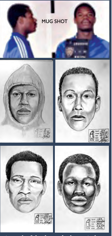
A sample of sketches under hypnosis that led to identifications and convictions.